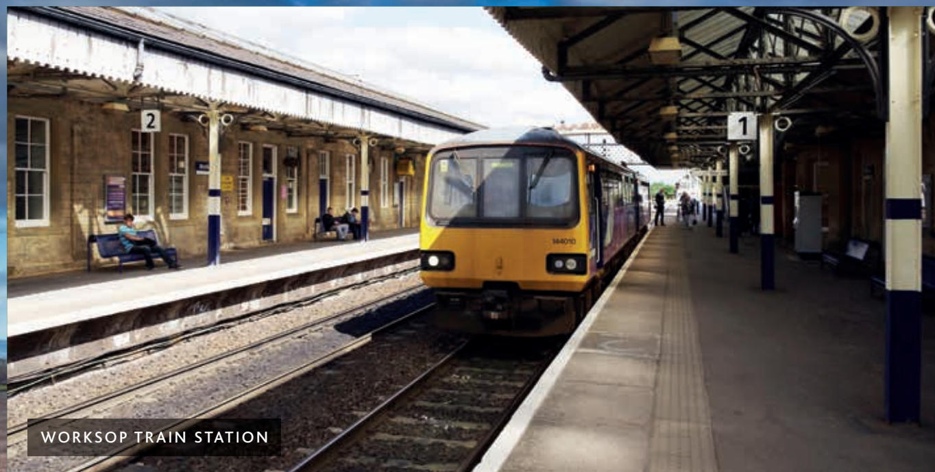
WORKSOP TRAIN STATION