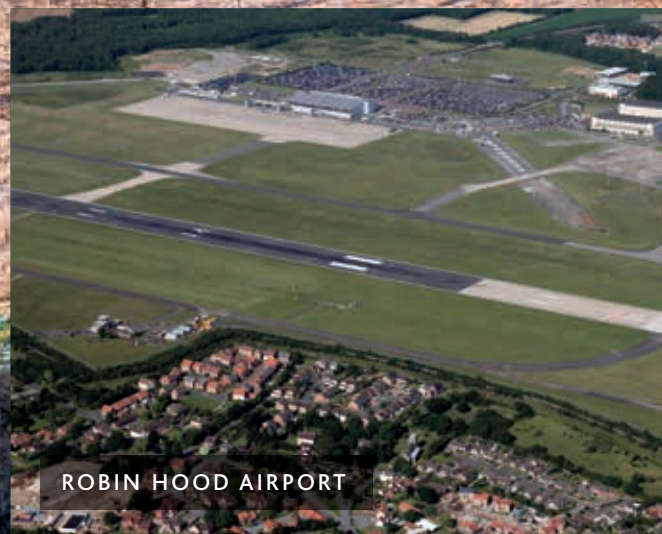
ROBIN HOOD AIRPORT